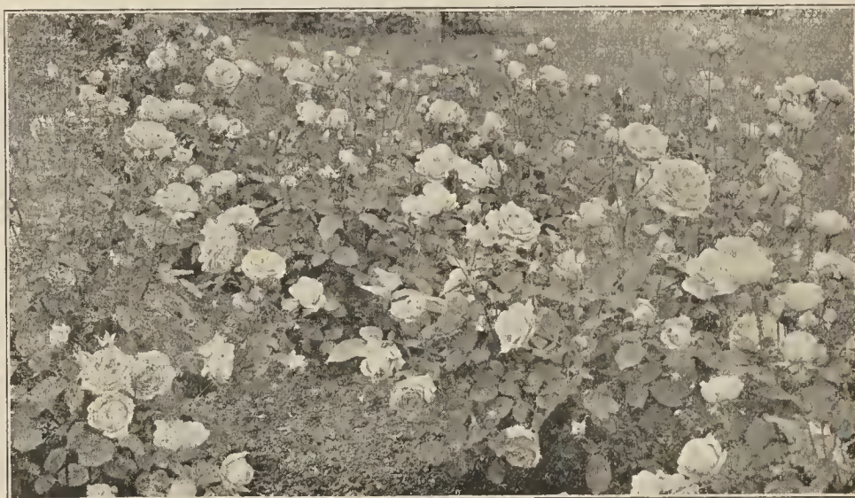
Beautiful Bessie Brown

ABBREVIATIONS USED—Per., Pernetiana; B., Bourbon; C., China or Bengal; C. B. Climbing Bourbon; C. H. Poly., Climbing Hybrid Polyantha; C. H. T., Climbing Hybrid Tea; C. Poly., Climbing Polyantha; C. T., Climbing Tea; S. C. T., Semi-Climbing Texas; H. N., Hybrid Noisette; H. P., Hybrid Perpetual; H. Poly., Hybrid Polyantha; H. T., Hybrid Tea; L. Laevigata or Cherokee; Bks., Banksia; M., Moss; Mtf., Multiflora; H. Mtf., Hybrid Multiflora; C. N., Climbing Noisettes; Poly., Polyantha; R., Rugosa; T., Tea; W. Wichuraiana; H. W., Hybrid Wichuraianas; H. C., Hardy Climbers.